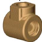
New housing style as of May 2005.